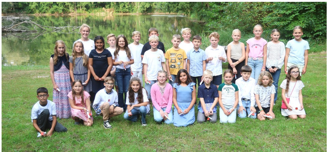
Our Sextans 2025/2026